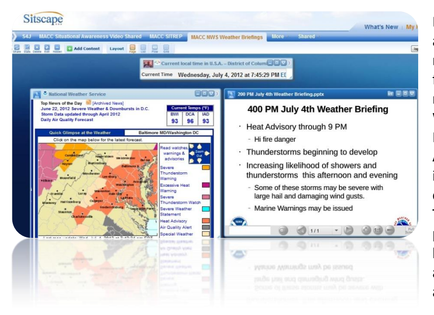
Figure 2 - SitScape 4th of July Weather COP. This display helped National Weather Service (NWS) and National Oceanic and Atmospheric Administration (NOAA) meteorologists monitor and predict weather activity throughout the National Capitol Region on 4 July, 2012

In addition to desktop applications, USPP and the other emergency units participating in 4<sup>th</sup> of July National Mall Security operations used a number of web based applications to facilitate completion of their missions. SitScape's ability to combine parts of web pages, video, and standalone applications into concise, distributable, secure COPs played a large role in the information flow during the events on the National Mall. SitScape combined web based emergency management applications like WebEOC with IP and web based video cameras to combine information for watch commanders, and command centers to access those sources remotely.